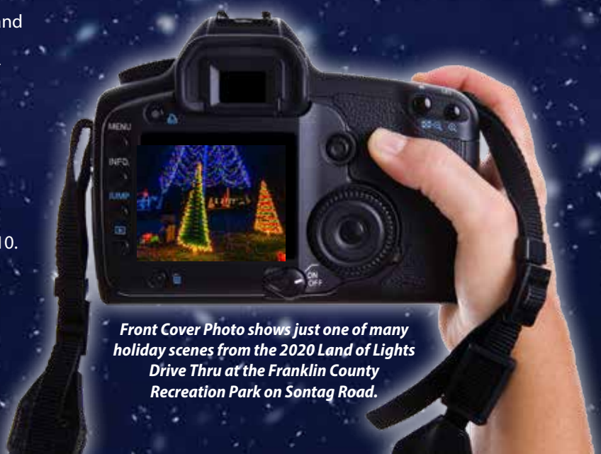
Front Cover Photo shows just one of many holiday scenes from the 2020 Land of Lights Drive Thru at the Franklin County Recreation Park on Sontag Road.